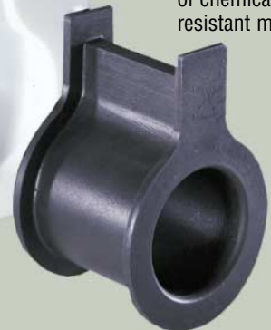
Replaceable elastomeric liners molded from a wide selection of chemically resistant materials.