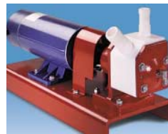
Variable speed drive