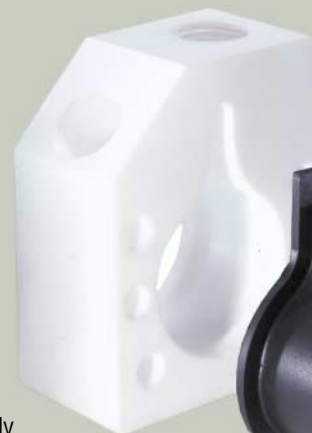
Body blocks of Teflon, polypropylene or polyethylene.

Only these two (2) nonmetallic components contact the fluid being pumped.