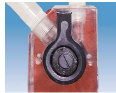
Rotor on eccentric shaft