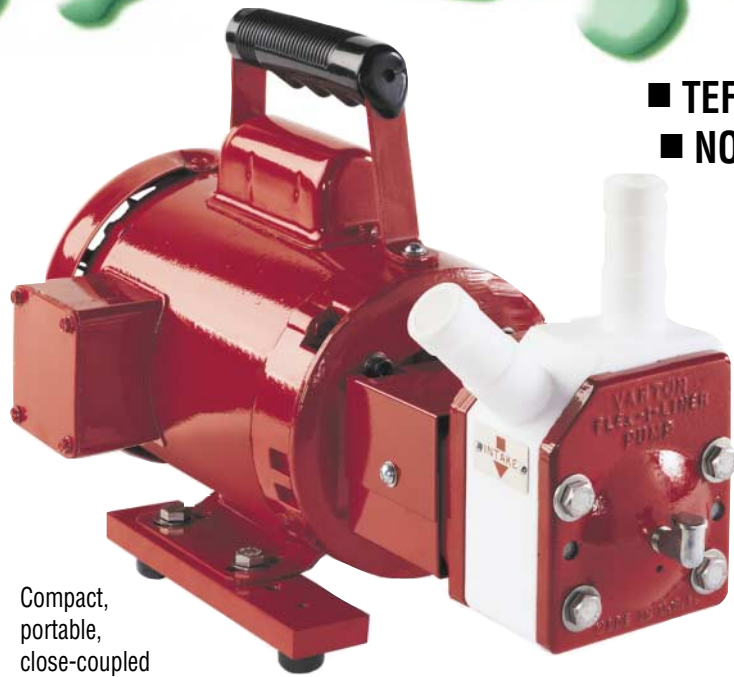
Compact, portable, close-coupled Flex-i-Liner ® pump with totally enclosed electric motor.