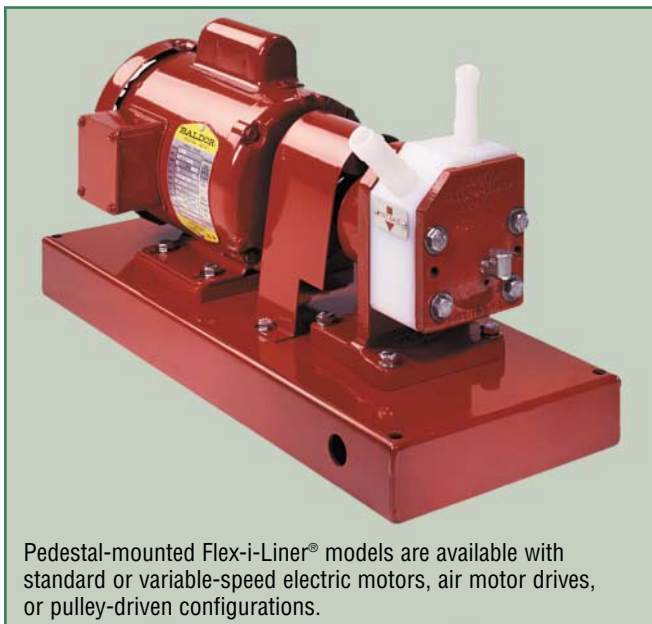
Pedestal-mounted Flex-i-Liner ® models are available with standard or variable-speed electric motors, air motor drives, or pulley-driven configurations.

Flexi-i-Liner ® peristaltic type rotary pumps are engineered for dependable, leakproof handling of acids, caustics, salts, abrasive slurries, solvents, chlorides, and other clear or viscous fluids, even those containing soft solids. These nonmetallic pumps operate in either direction, wet or dry, and in any position. Their gentle pumping action minimizes foaming, prevents settling out of suspensions and permits safe handling of latex emulsions and other shear-sensitive liquids. Designed without stuffing boxes, glands, shaft seals or internal valves, there is no danger of external leakage. Only two components are in contact with the fluid — the inner surface of the plastic pump body and the outer surface of the rugged replaceable elastomeric flexible liner. This easy-to-service construction keeps maintenance and downtime low. More than 125,000 of these dependable sealless, self-priming pumps are in service handling aggressive and other problem fluids.