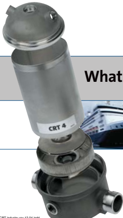
CRT industry rev 12 04.indd

Titanium offers a reliability other materials cannot match. Even a decade of full immersion in salt water will not leave a blemish on a titanium metal surface.