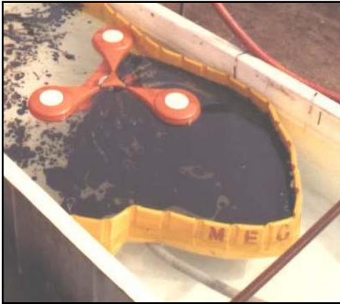
Preventing an oil spill from contaminating a tank.