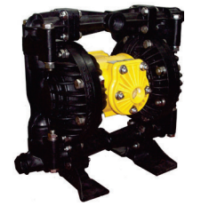
Ebony Series Noryl Body- Corrosive Resistant Internals- For Acids And Other Hazardous Liquids.