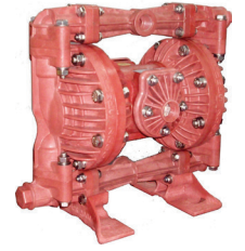
Red Series FRASplas Body- Fire Retardant Antistatic Construction - Safe for Explosive Environments Atex M1 Rating