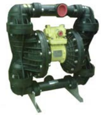
Ebony Series Noryl Body- Corrosive Resistant Internals- For Acids And Other Hazardous Liquids.