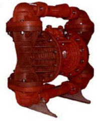
Red Series FRASplas Body- Fire Retardant Antistatic Construction - Safe for Explosive Environments Atex M1 Rating